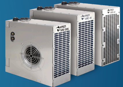
ARC-30S ARC-45 ARC-60

PART OF APSCO'S COMPLETE LINE OF COOLING SYSTEMS